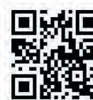
Scan this code with your smart phone to know more about KBL

KBL is the only pump manufacturing company in India and ninth in the world to be accredited with the N and NPT certification by American Society of Mechanical Engineers (ASME).